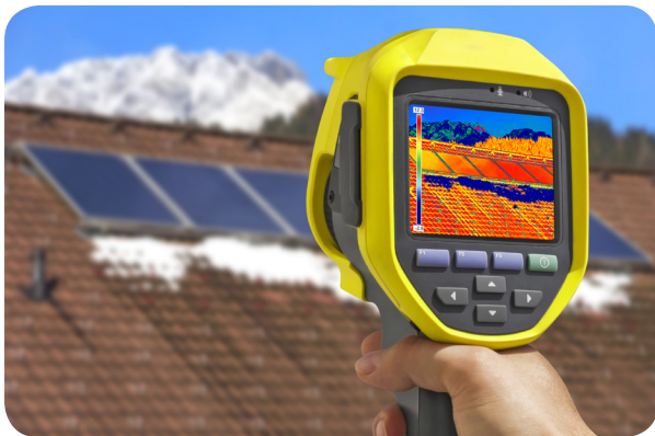
Infrared camera identifying air leakage.

Sign Up today! Visit EnergySmartColorado.com