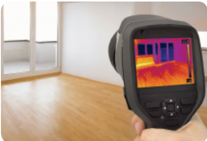
Infrared camera identifying air leakage.

Sign Up today! Visit EnergySmartColorado.com