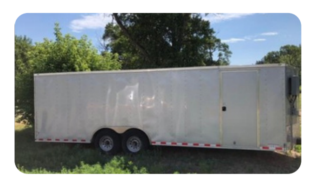
Example of a reusable station.