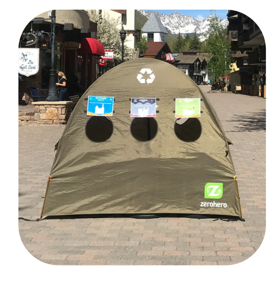
Example of a Zero Hero station.