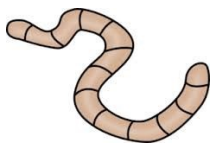
An insect or a worm