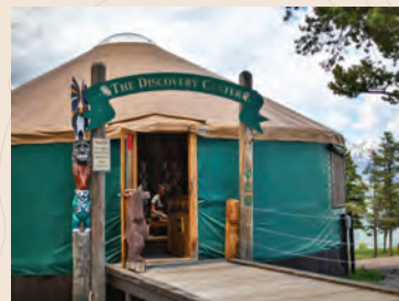
◀ NATURE DISCOVERY CENTER ON VAIL MOUNTAIN